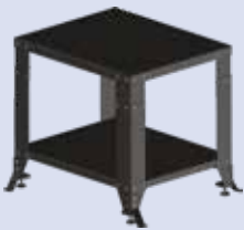
Table TAB-98 PRO Strong support table, perfect for Sefa presses.